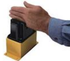
Ergonomic Palm Buttons