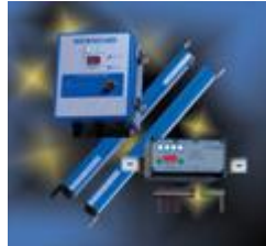
Safety Light Curtains